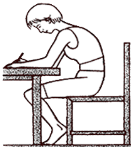
Figure 1: Slumped posture contributes to sternosymphysal syndrome.

Many of us find that we have become more slumped over than we would like. This can be more than just an unpleasant cosmetic issue, but be a hidden cause of musculoskeletal stress or pain. Conditions such as headache, jaw pain, neck pain, shoulder pain, numbness or tingling in the arms or hands, or shoulder blade pain can all arise without any injury, yet be due to cumulative factors associated with the repetitive strain of poor posture!